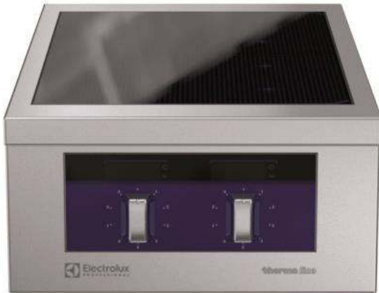
588019 (MAIBAADOAO) Induction Top, 2 zones, one-side operated